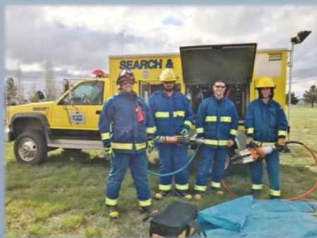
Team members participating in Freshman Impact exercise for Douglas High School