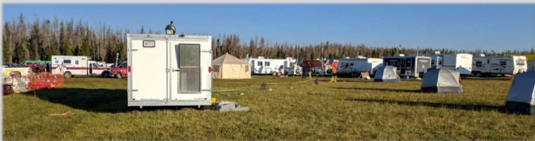
Keystone Fire, Incident Command - generator in foreground and command trailer along the trees.