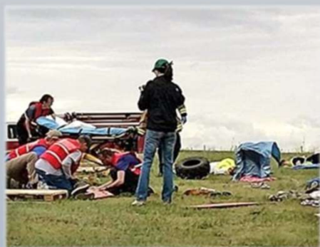
Team members participating in the mass casualty exercise at the Rapid City Regional Airport