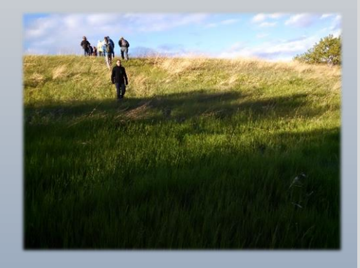
Following a compass bearing during navigation check sheet night