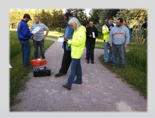
Navigation check sheet night. GPS receiver and compass courses at the Outdoor Campus