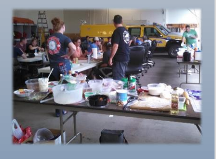
Due to severe weather coming in, the picnic was moved to our barn