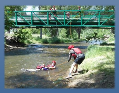
Pulling an individual to shore after performing a lasso rescue from the bridge spanning the waterway