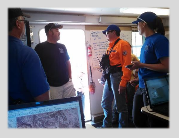
Coordinating field activities.