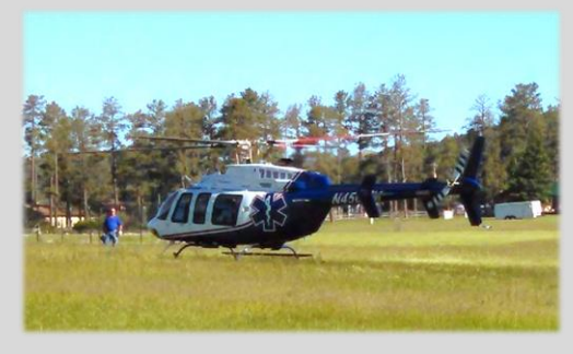
Black Hills Life Flight joins the search between their own calls for service