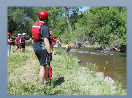
Swiftwater shore rescue training with throw bags on Rapid Creek