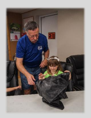
One use for a garbage bag is a poncho for protection

How rescues are made on water or ice with an open ended Rapid Deployment Craft