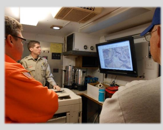
PCSAR and PCSO planning during night operations