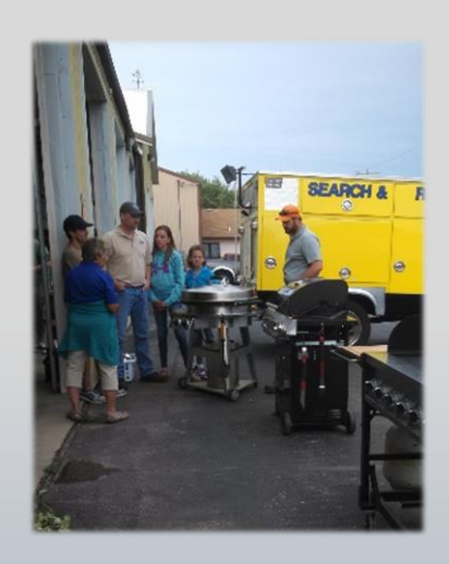
For our annual team and family picnic we tried something new – pizza grilling!