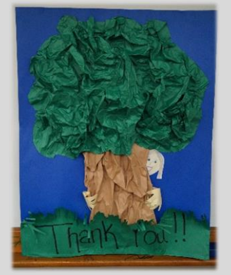
Awesome thank you poster received from the school!