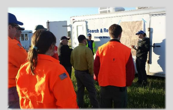
Morning briefing before searchers head out to their assigned areas