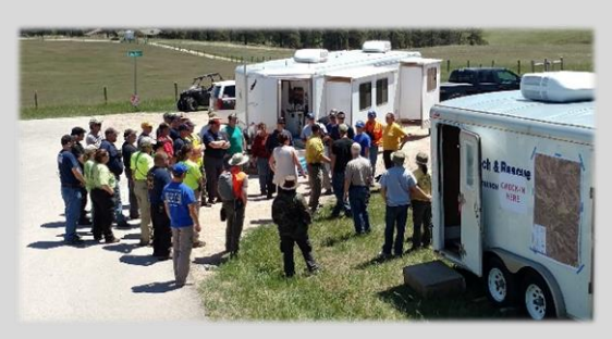
Happy ending with the family and many agencies that participated in the search