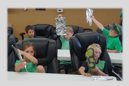
Making a foil cast of their shoe print for identification

Students from the Rapid City Regional Hospital Summer School stopped in to our facility in June. Over the course of four days, students from Kindergarten through 5<sup>th</sup> grade participated in the Hug-A-Tree program and toured the facility. The Hug-A-Tree program teaches children to stay in place if lost so they will be easier to find and some basic skills to help them survive.