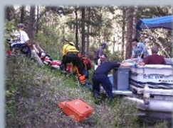
Boaters on Pactola offered an alternative for a rough carryout to the waiting ambulance