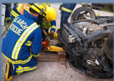
New approach to a hard extrication