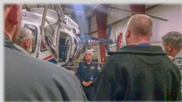
Training with Life Flight