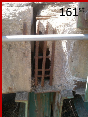
161 st Ave Bridge