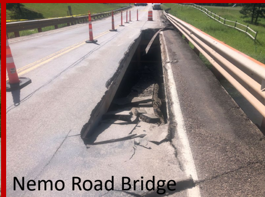
Nemo Road Bridge