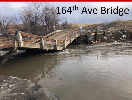
164 th Ave Bridge

Inflation, material and fuel costs have increased construction costs significantly, reducing the amount of work that can be done in a year with current funding sources. The average cost of bridge replacements has increased approximately $250,000 since 2020. The current wheel tax revenue has never been sufficient to support Pennington County’s road and bridge work needs. Increasing the wheel tax to $5/wheel could generate an additional $2.2 million in funding for roads and bridges as well as increase opportunities in State grant applications without raising local matching dollars. Since implementing the wheel tax in 2021, Pennington County has successfully been awarded 3 bridge replacement grants and 4 bridge preservation grants in the amount of $2,088,500.